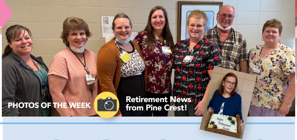
PHOTOS OF THE WEEK

A Weekly Update For The Employees of North Central Health Care